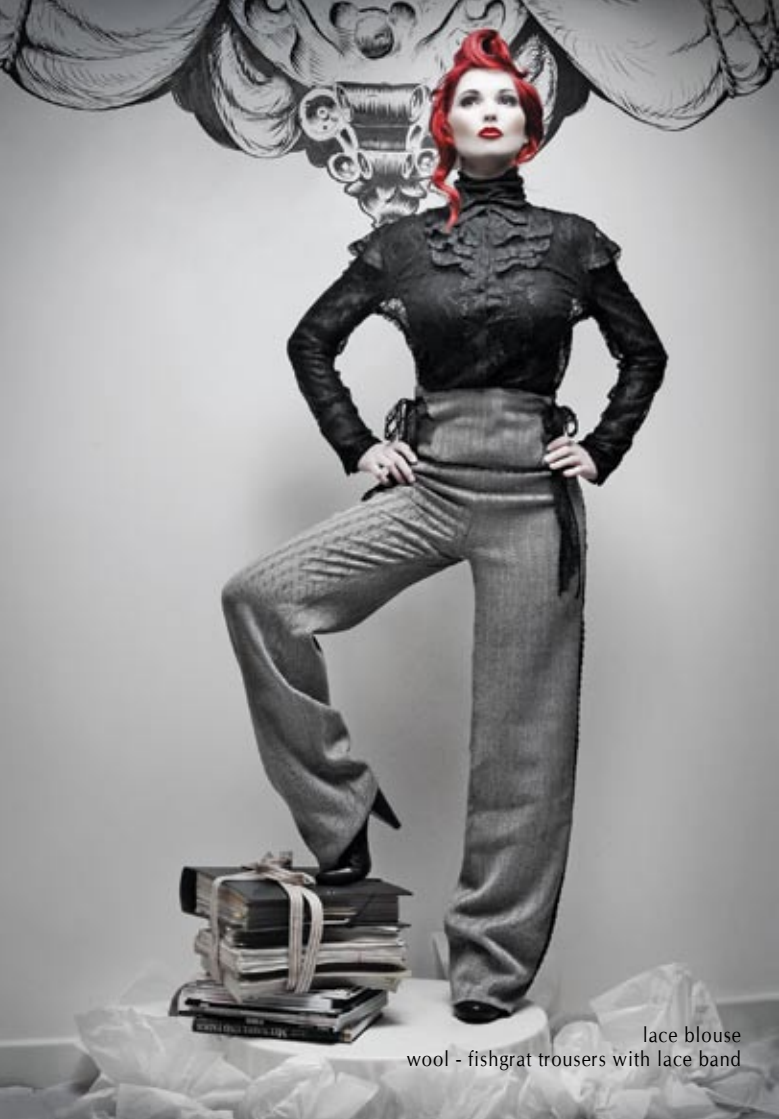
lace blouse wool - fishgrat trousers with lace band