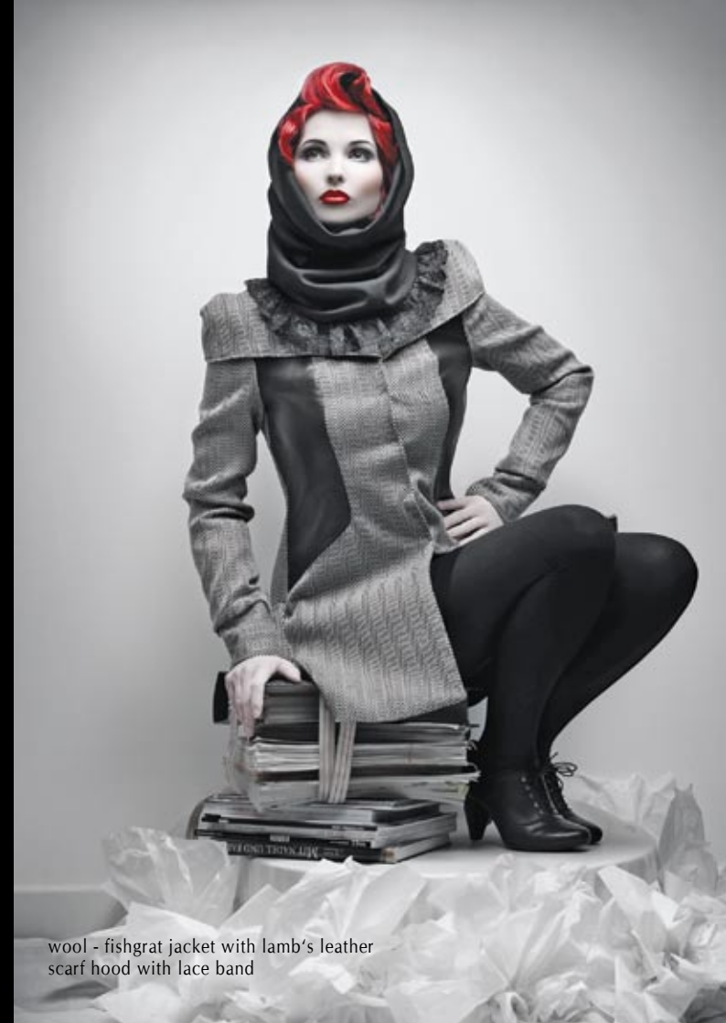
wool - fishgrat jacket with lamb's leather scarf hood with lace band