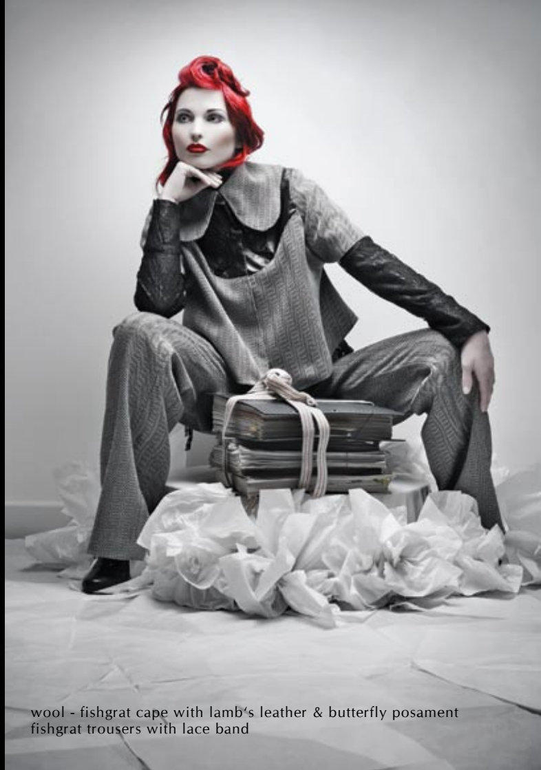
wool - fishgrat cape with lamb's leather & butterfly posament fishgrat trousers with lace band