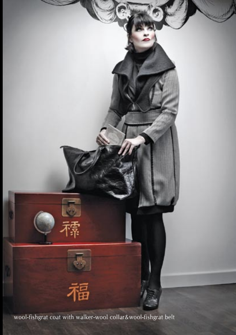
wool-fishgrat coat with walker-wool collar&wool-fishgrat belt