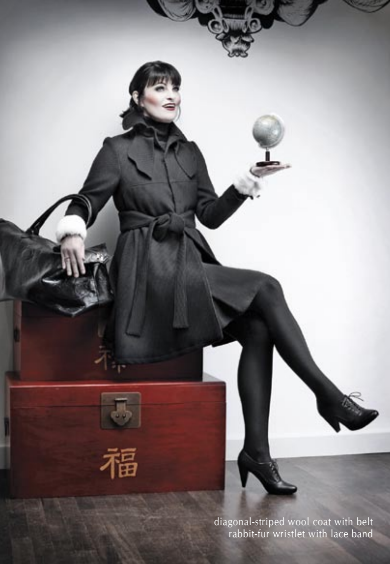
diagonal-striped wool coat with belt rabbit-fur wristlet with lace band