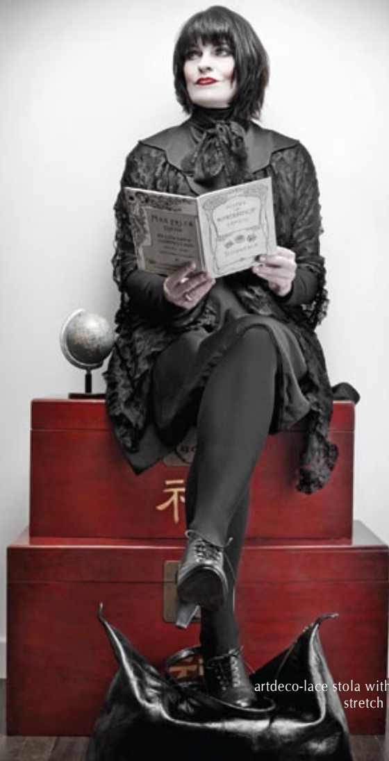
artdeco-lace stola with lace seam stretch satin collar lace belt