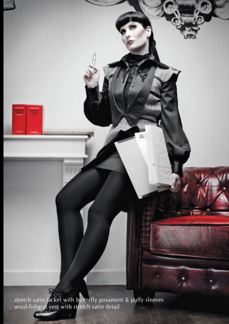
stretch satin jacket with butterfly posament & puffy sleeves wool-fishgrat vest with stretch satin detail