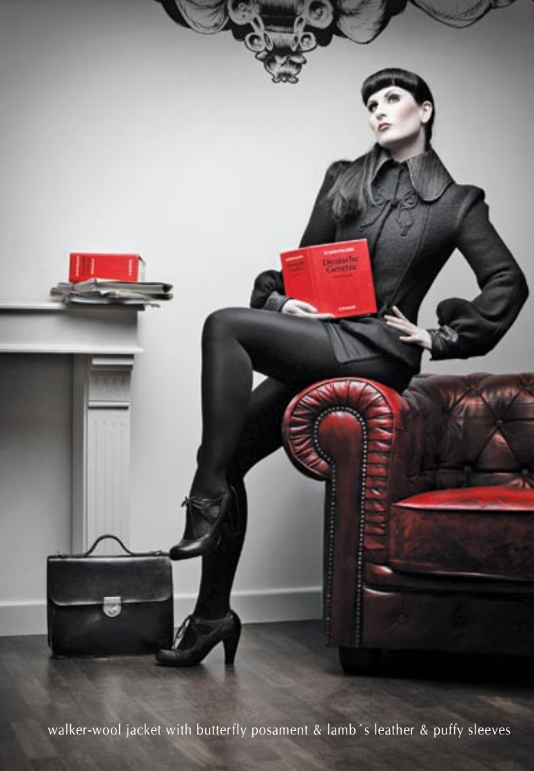
walker-wool jacket with butterfly posament & lamb's leather & puffy sleeves