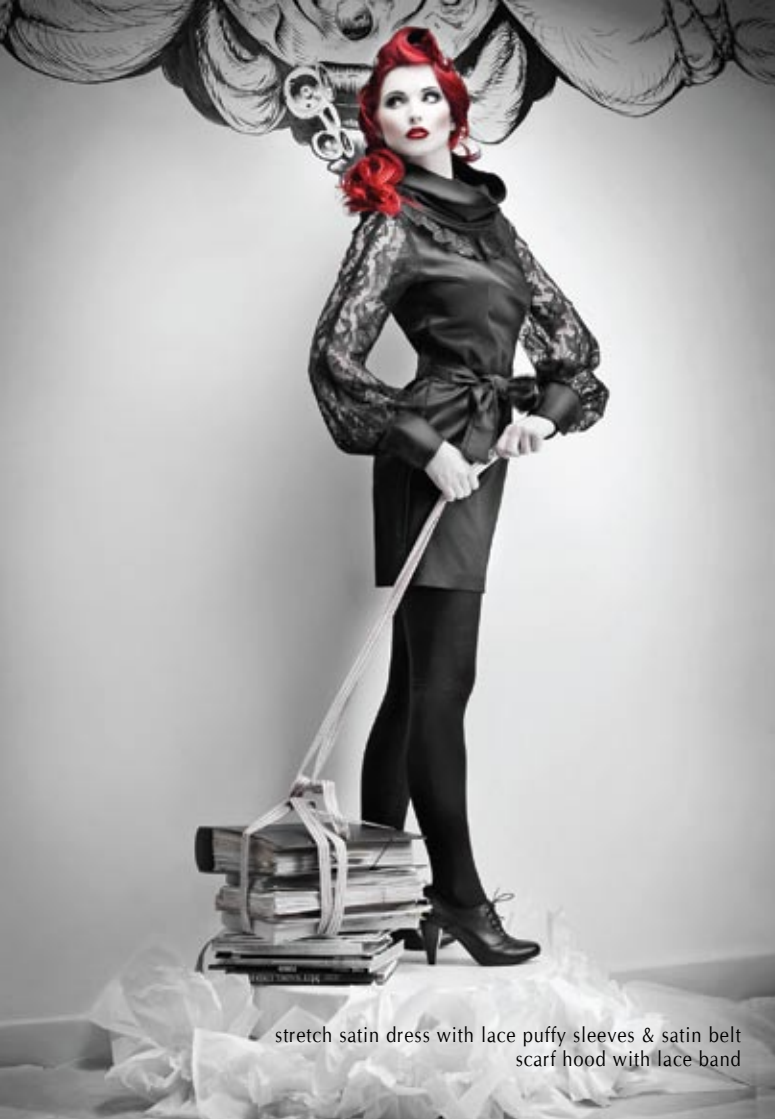
stretch satin dress with lace puffy sleeves & satin belt scarf hood with lace band