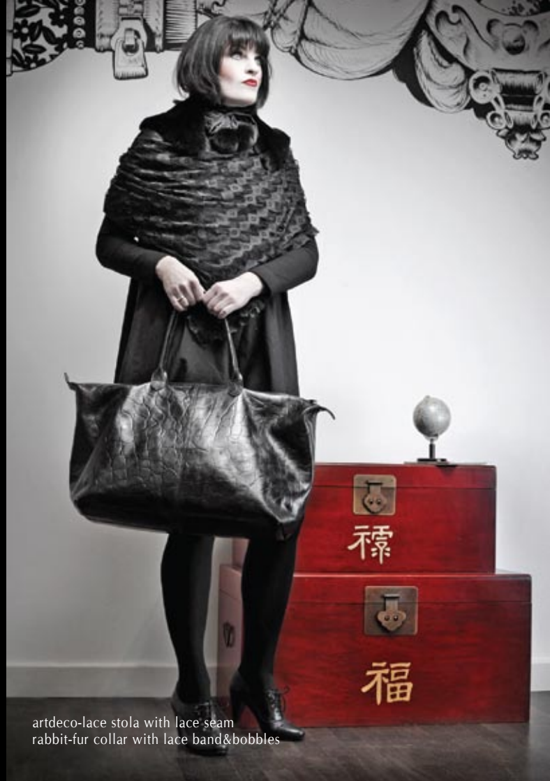
artdeco-lace stola with lace seam rabbit-fur collar with lace band&bobbles